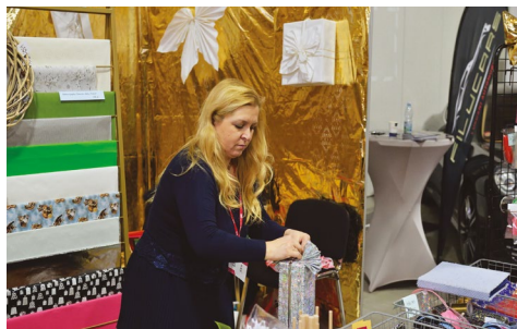
TABLE SET UP IN THE MOST BEAUTIFUL WAY

This competition was attended by gastronomic and gardening schools in cooperation with students and teachers. Students set up Christmas tables according to their fantasy or regional habits, and visitors chose the most beautiful one. The winning school received a PR article and an interview in the Časopis pro Kvalitní ŽIVOT magazine.