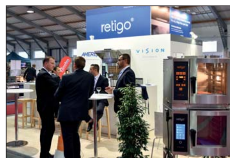
HALL 2 offered furniture and equipment for the HoReCa segment