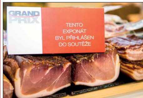
3 rd place: Chovaneček s.r.o. For: Pršuto KLAŠTERNÍ ŠUNKA (MONASTERY HAM prosciutto)