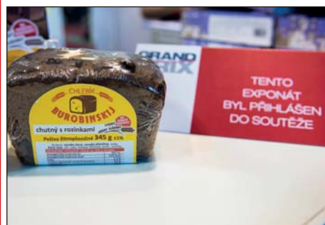
2 nd place: Apple - Sin s.r.o. For: Bread Burobinskij „Borodinskij“