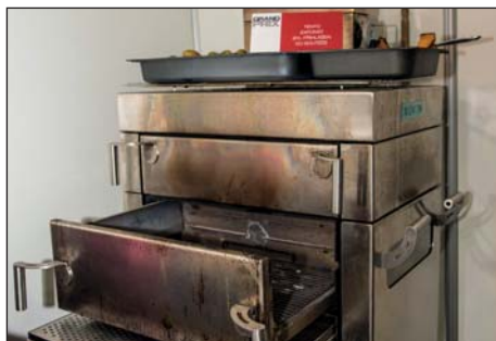
3 rd place: Premium gastro For: Charcoal furnace X-OVEN