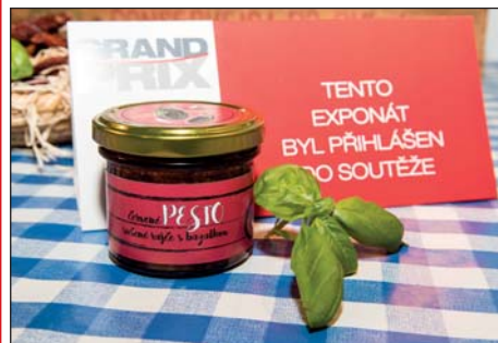
1 st place: Zach's pesto & chilli s.r.o. For: Pesto made of dried Italian tomatoes