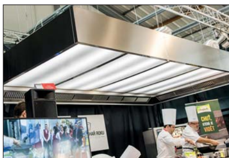
2 nd place: ATREA s.r.o. For: Ventilation and illumination ceiling "ATREA"