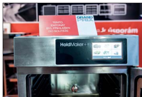
The HONOURABLE MENTION was granted to HoldMaker+ s.r.o. for an energy saving product.