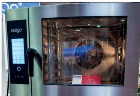
1 st place: RETIGO s.r.o. For: Steam convection oven "Retigo Vision Blue 1011"