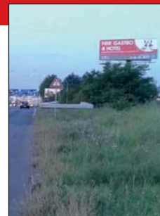
Example of the BB campaign

The exhibiting firms which register for participation in the trade fair obtain a possibility of using the massive advertising campaign of the trade fair and a possibility of obtaining subsidised billboards in the Euro-format at a price of CZK 4,800 + VAT per item, including the print and application for the entire calendar month. The only condition is publishing of the FOR GASTRO & HOTEL Trade Fair caption.